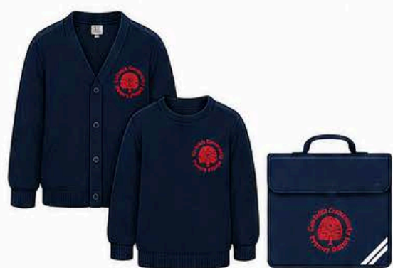
Navy Blue Cardigan or Navy Blue Jumper with School Logo