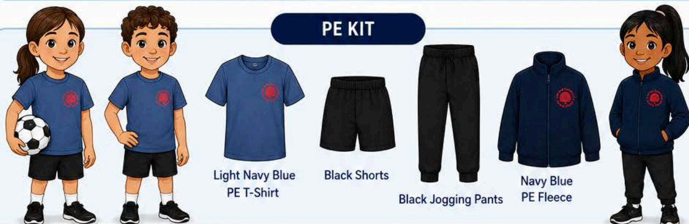
Light Navy Blue PE T-Shirt