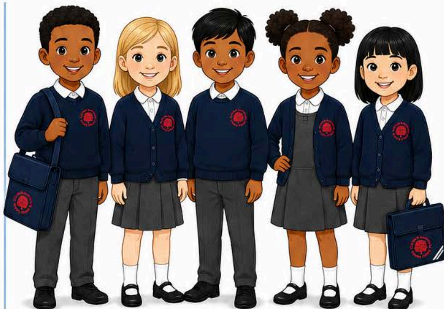
Navy Blue Bookbag with School Logo